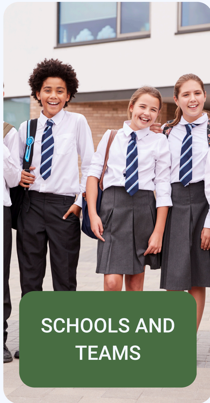
SCHOOLS AND TEAMS