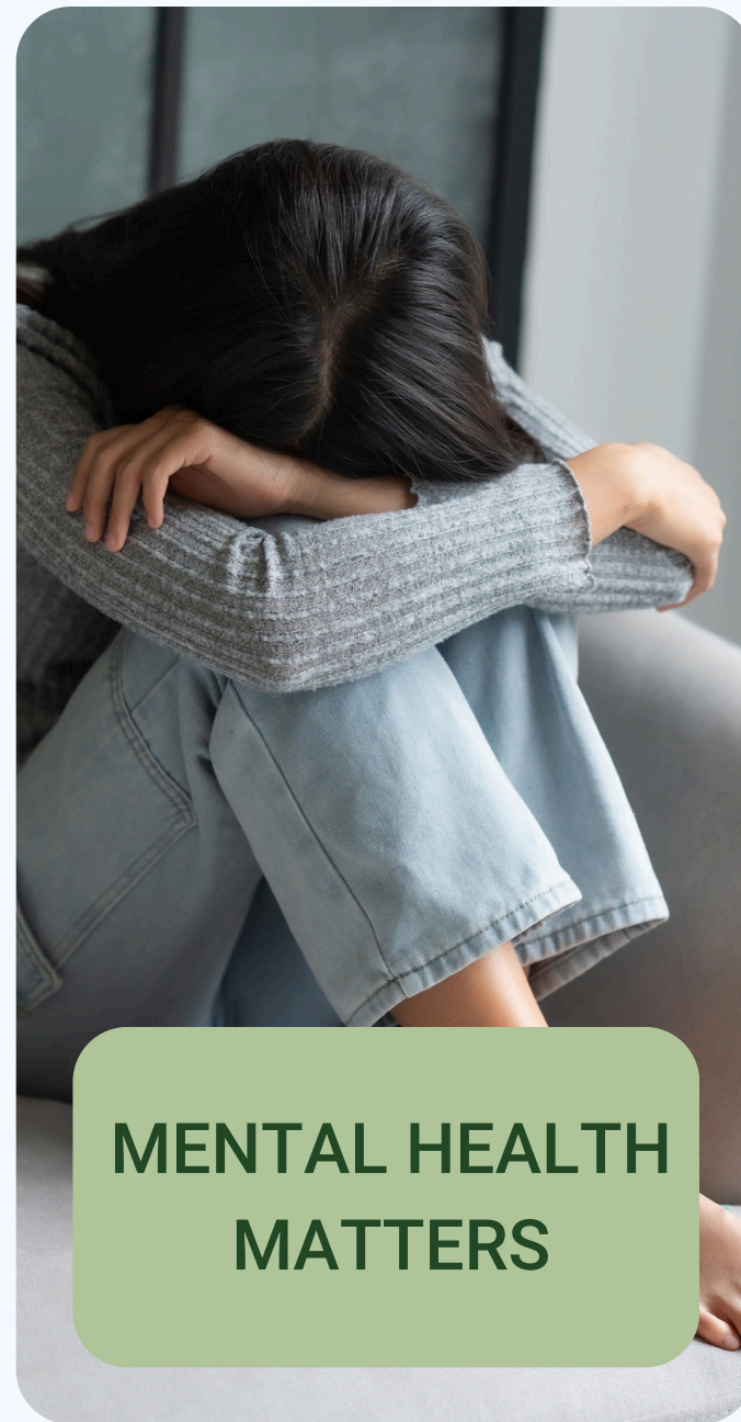
MENTAL HEALTH MATTERS

All sponsorship funds raised through the Women's Mental Health World Cup will go to the Melp Foundation to: